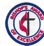
Bishop's Award of Excellence